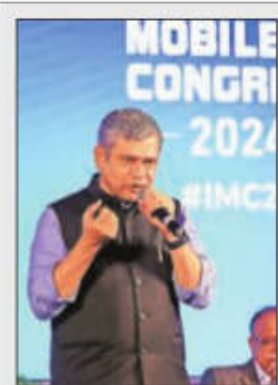
THROUGH THIS SPECTRUM REGULATORY SANDBOX, WE'LL GIVE VERY EASY PORTAL-BASED PERMISSIONS ASHWINI VAISHNAW, COMMUNICATIONS AND IT MINISTER

IN A BID to enhance ease of doing business in the telecom sector, the department of telecommunications (DoT) on Monday announced a regulatory sandbox policy to give easy permission for spectrum needed in any kind of trials of equipments and research and development (R&D).