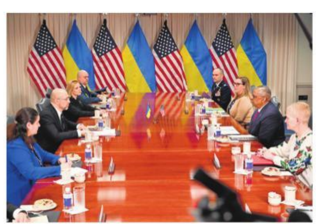
US Defence Secretary Lloyd Austin holds talks with Ukrainian Prime Minister Denys Shmyhal at the Pentagon

A document reviewed by AFP — this one marked "secret" details the dire state of Ukrainian air defenses, which have been instrumental in protecting against Russian strikes and preventing Moscow's forces from gaining control of the