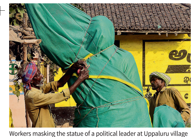
in Krishna district as the MCC came into force on Saturday. G.N. RAO

TTD officials informed that the restrictions have been implemented immediately and will be in place till the termination of the election code in June.