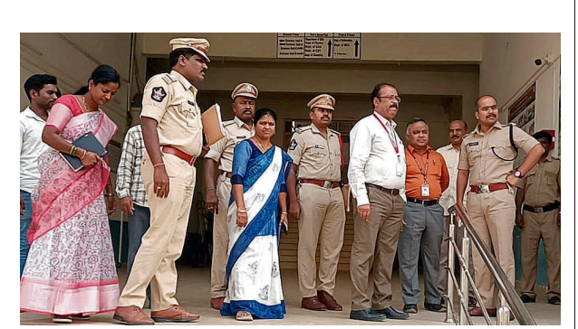
High School in Madanapalle of Annamayya district on Saturday.

The SP, along with senior police officers from the Madanapalle, Rayachoti, and Rajampeta divisions, inspected the Mada-Assembly constituency. The team first inspected the strongrooms and polling centres at Madanapalle ZP High School and MITS Engineering College, they later visited Ramasamudram mandal to inspect the police