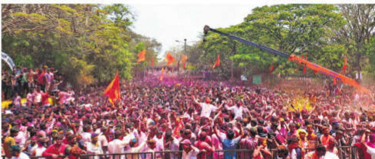
People soaked in colours during Holi celebration in Dharwad. Thousands of people gathered and enjoyed rain dance, pot breaking and other events. The city observed a peaceful celebration without any untoward incident