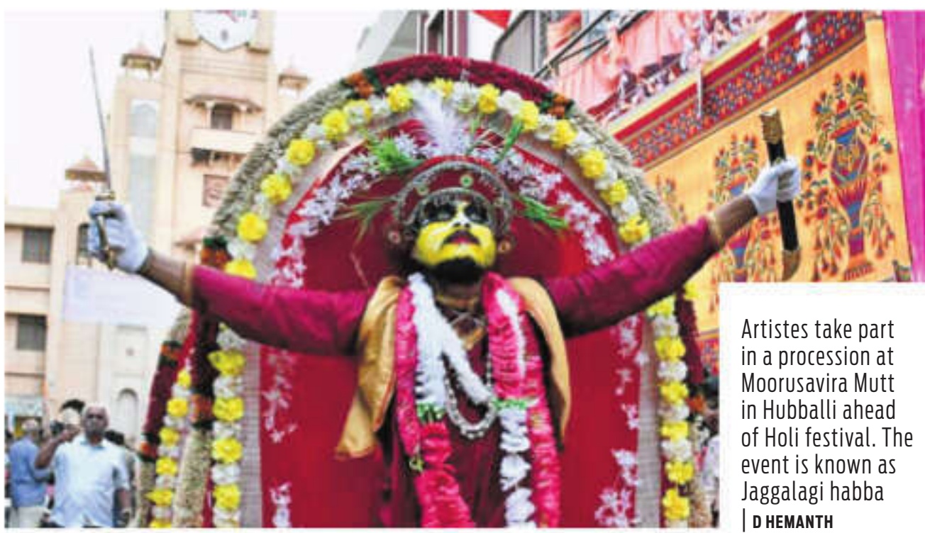
Artistes take part in a procession at Mooruvavira Mutt in Hubballi ahead of Holi festival. The event is known as Jaggalagi habba