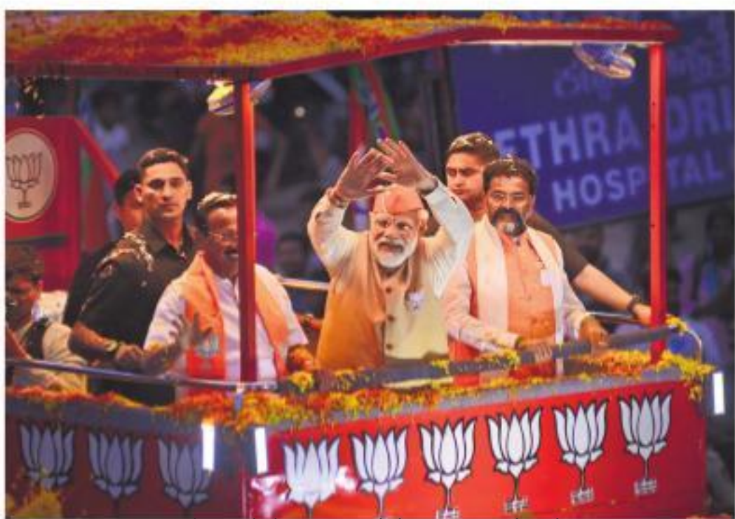
Prime Minister Narendra Modi during a road show in Bengaluru | VINOD KUMAR T