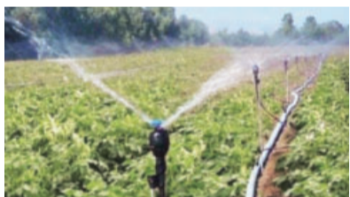
Limit of subsidy for the construction of plastic lining farm ponds has been increased to ₹1.20 lakh from ₹90,000

He said non-small-marginal farmers of scheduled caste-tribe would get an additional subsidy of 10 per cent like small and marginal farmers. To provide them support, the limit of subsidy for the construction of plastic lining farm ponds has been increased to ₹1.20 lakh from ₹90,000.