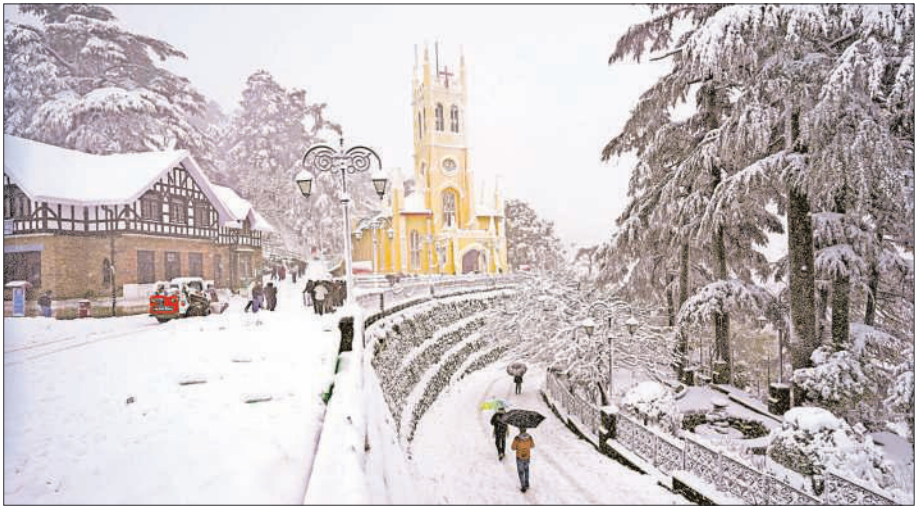
People walk on a snow-covered road at the Ridge, and (right) workers fix a transformer, in Shimla on Friday.