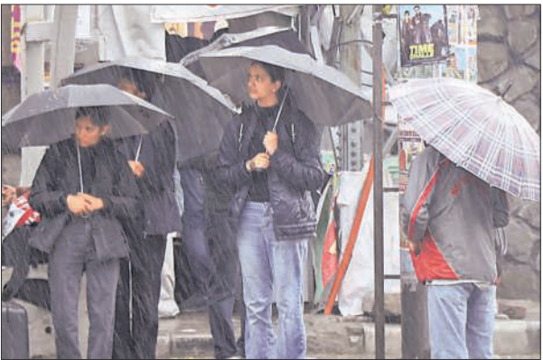
Commuters wait for bus amid rain at Ferozepur Road, in Ludhiana on Friday.

Other districts such as Amritsar (19.8 mm), Ludhiana (16.2 mm) and Tarn Taran (15.8 mm)