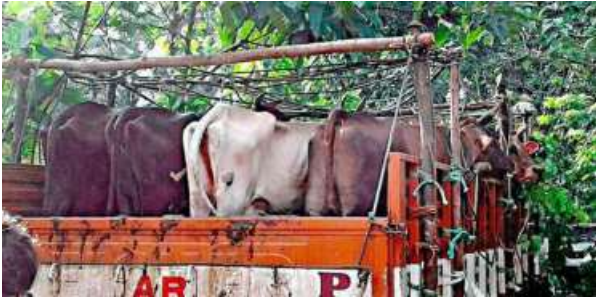
The Bill seeks to provide for release of vehicles seized during the illegal transportation of cattle for slaughtering.

The Bill that seeks to provide for release of vehicles seized during the illegal transportation of cattle for slaughtering on submission of “indemnity bond” instead of “bank guarantee”, that is equivalent of the value of vehicle as pre-