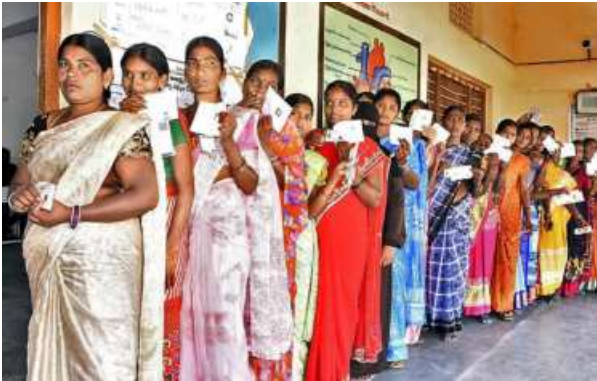
Voters wait to cast their votes during the second phase of Telangana panchayat polls in Shivampet on Sunday.