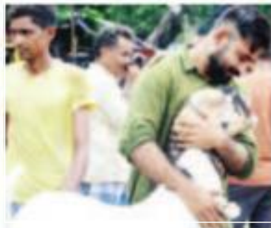
A livestock vendor waits for customers ahead of the Eid al-Adha at Hastings on Saturday.

No regulation of Metro services on Sunday: No track maintenance work will be undertaken in between Kavi Subhash and Mahanayak Uttam Kumar stretch of Blue Line of Metro Railway on Sunday. Now, as there will be no traffic block tomorrow, the first services from Dakshineswar, Dum Dum and Kavi Subhash will be available at 9 am, instead of 10 am as intimated earlier.